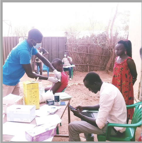
Covid 19 Vaccination Point